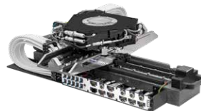
CHARON2 XYZ3TM stacked platform

Its position accuracy of \pm 1 \mu\text{m} level paired with excellent bidirectional repeatability and high dynamics sustains applications development in all technology and industry fields.