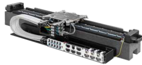
CHARON2 X linear axis

CHARON2 The CHARON2 platform is built on a robust, reliable and elegantly simple stacked architecture, designed with modularity and scalability principles in mind. It starts from a standalone X axis and scales to complete motion systems of up to 7 axes. There are 9 available standards with two different electronics for a total of 18 different configurations offered as off-the-shelf products. Its compatibility with current and future modules and options allows coverage of the broadest application space and use cases.